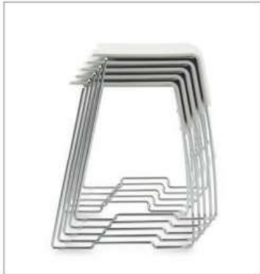
Stacks five high on floor