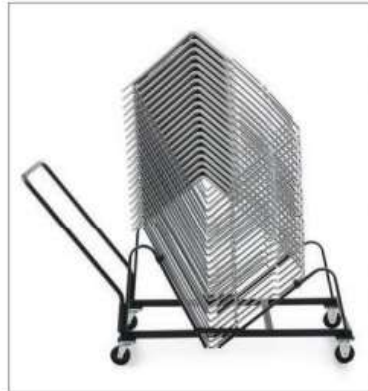
Stacks 20 high on dolly